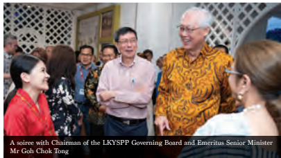
A soiree with Chairman of the LKYSPP Governing Board and Emeritus Senior Minister Mr Goh Chok Tong

Besides interactive lectures, Senior Fellows will participate in learning visits and discussion groups to gain insights into global trends and deepening knowledge in public leadership.