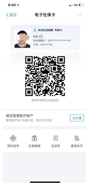
Screenshot of a Hangzhou resident's e-social security card in his Alipay app. The e-card also provides QR code for scanning. (The person's name, picture, and QR code were modified to protect personal information.)