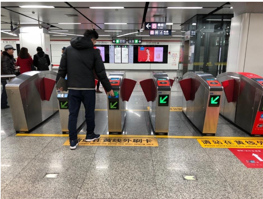
On January 11, 2018, A man scanning QR code on his phone as he enters a subway station in Hangzhou, China.