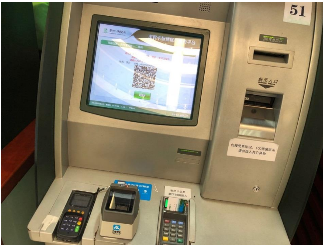
On January 11, 2018, a QR code on a self-service machine for patients to scan with their Alipay app. There are three payment methods: cash, bank cards, and mobile payment.