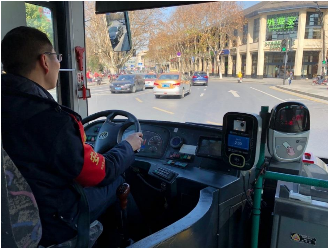
On January 11, 2018, on a bus in Hangzhou, there are three payment methods: cash, public transportation card, and mobile payment.