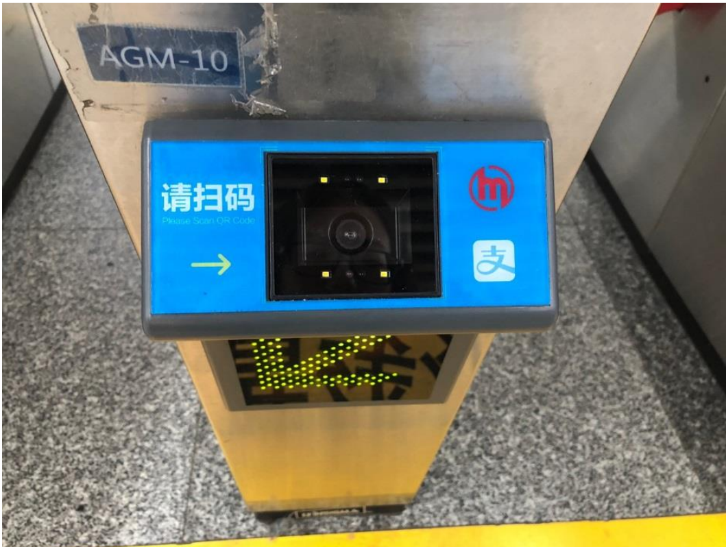
At the entrance of a subway station in Hangzhou, a QR code scanner has been installed on the ticket-reading machine.