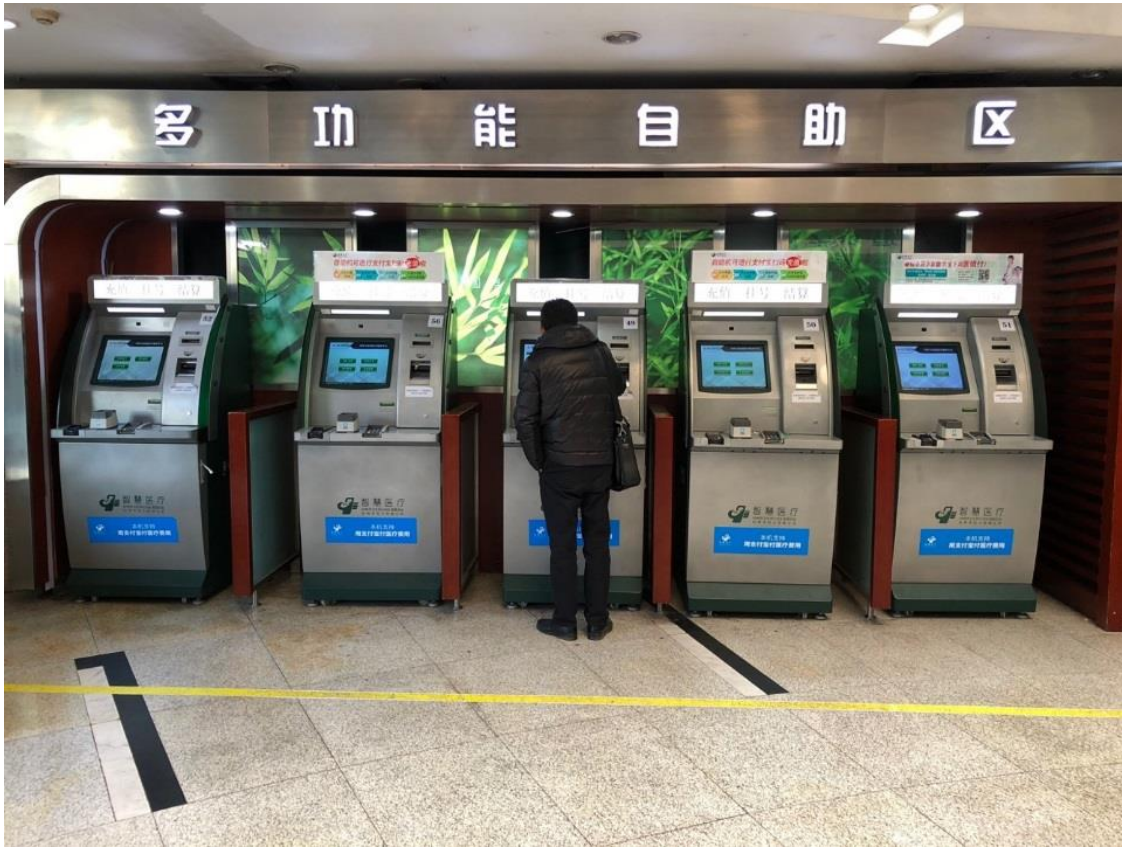
On January 11, 2018, a man uses a self-service machine, which allows mobile payment services, in the multi-functional self-service zone at No.1 People's Hospital of Hangzhou.