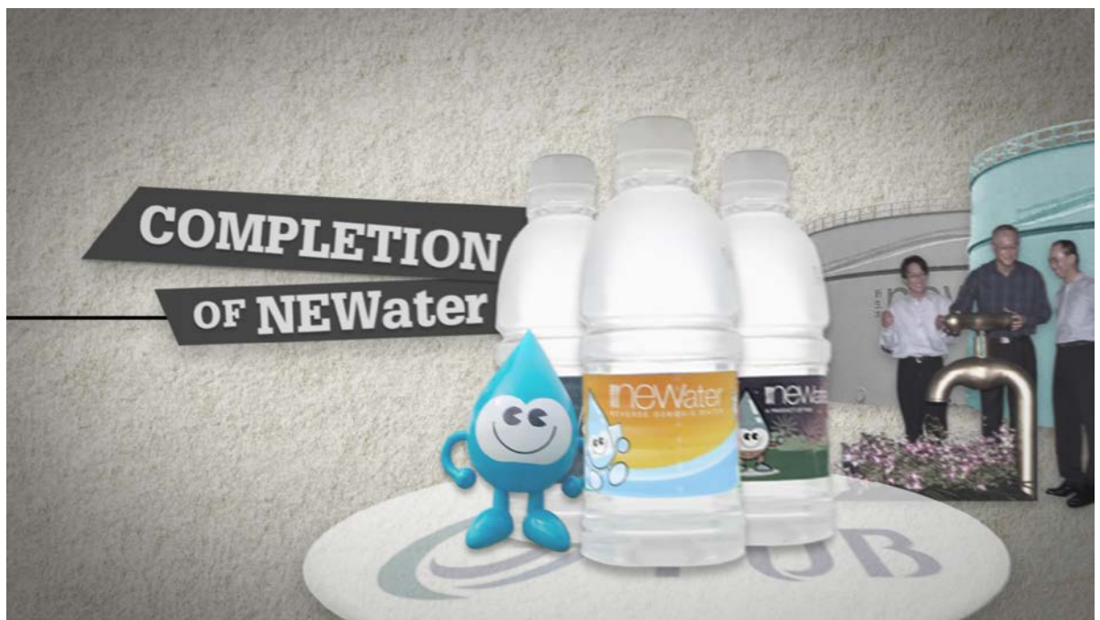
Figure 7: The completion of NEWater