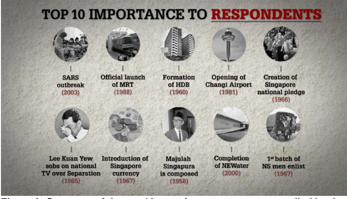
Figure 9: Summary of the top 10 most important events as polled by the respondents