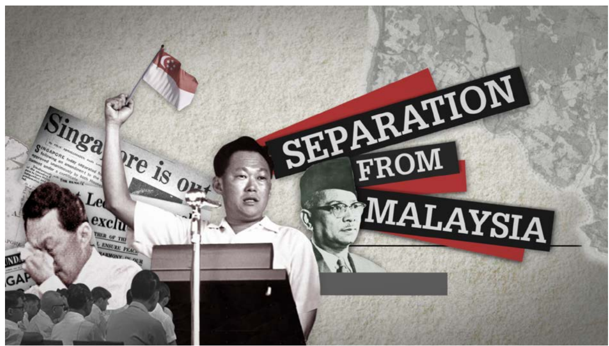
Figure 4: The moment Mr Lee Kuan Yew sobbed on national television over the separation of Singapore from the Federation of Malaysia