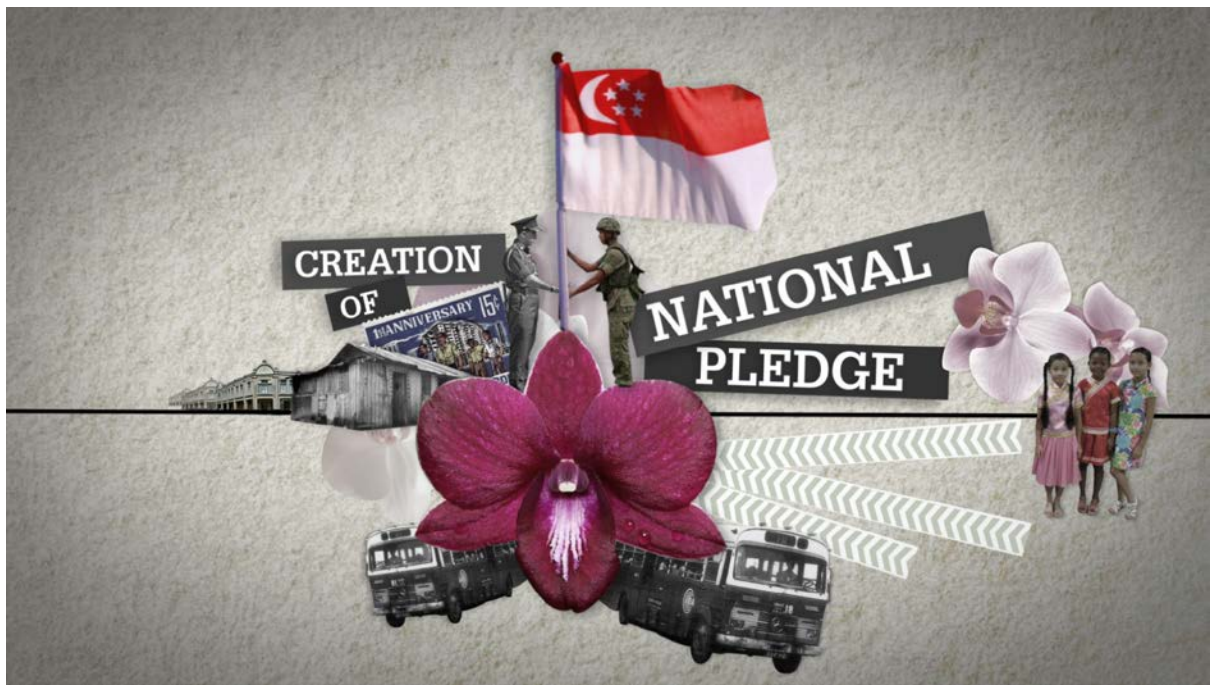
Figure 5: The creation of the national pledge