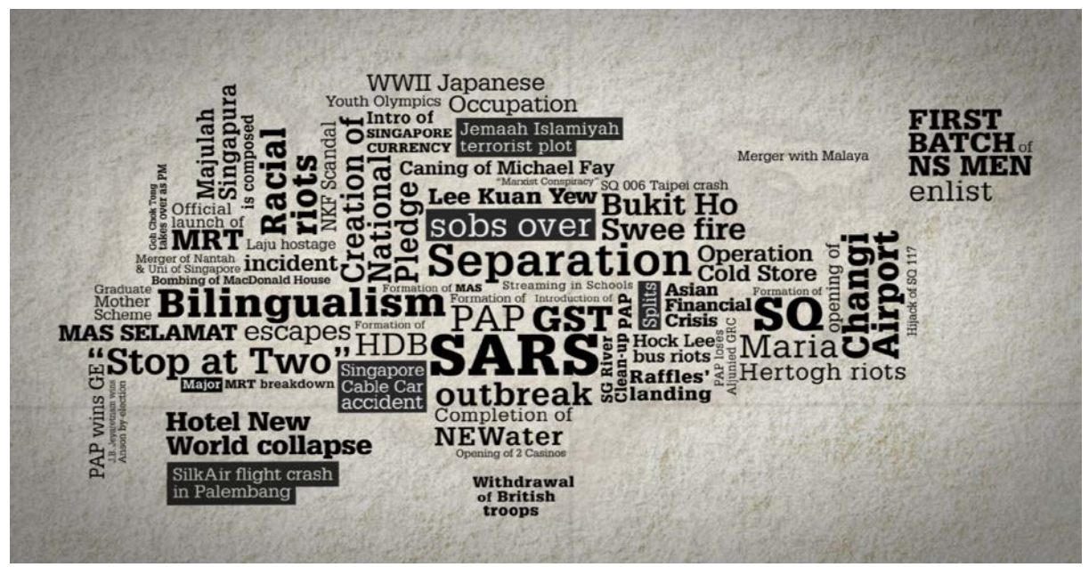
Figure 2: Map of Singapore showcasing the 50 events from the study