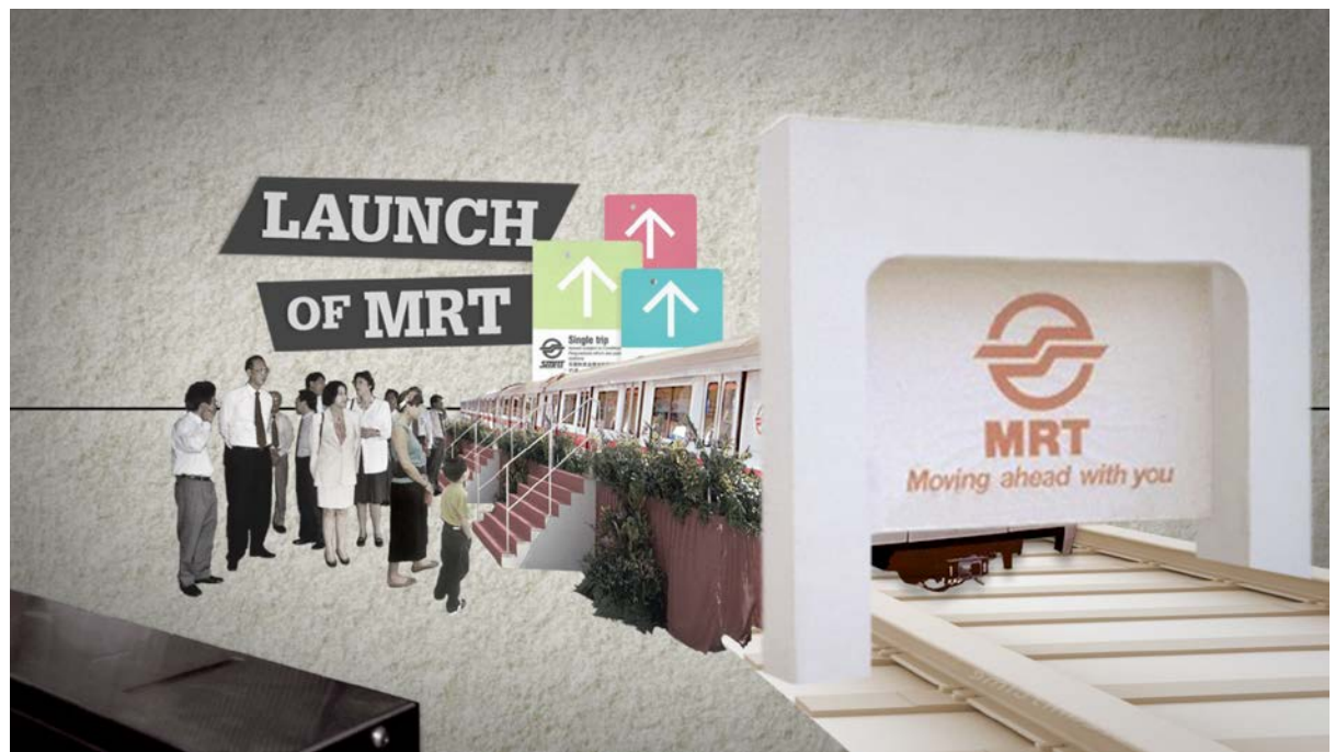
Figure 6: The official launch of the MRT system