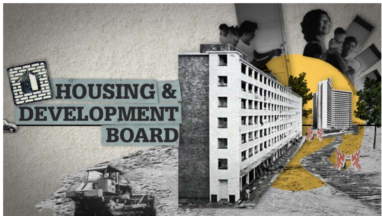
Figure 3: The formation of the Housing & Development Board