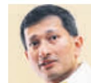
Dr Vivian Balakrishnan