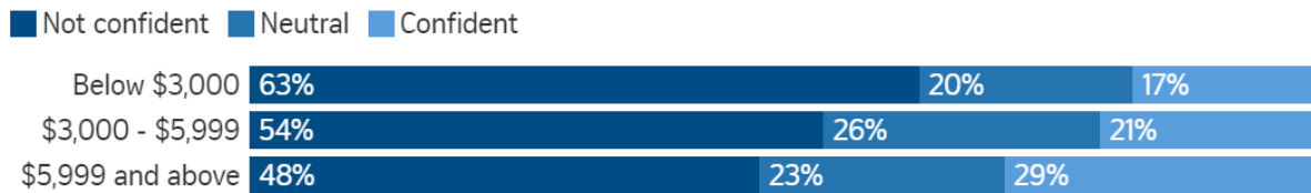
Chart: STRAITS TIMES GRAPHIC • Source: IPS

On vaccination, seven in 10 people said vaccination should be made compulsory for all Singaporeans and long-term residents, while nine in 10 agreed that annual booster shots were important to reduce the risk of infection.