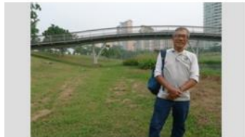
A Lifetime of Learning and