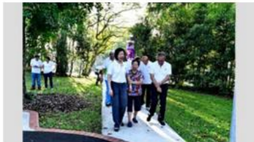
A Cleaner and Safer Route for

Read how residents and agencies work together to resolve municipal matters.