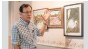
An Artistic Pursuit of Nature