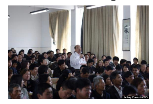
National Volunteerism (US)