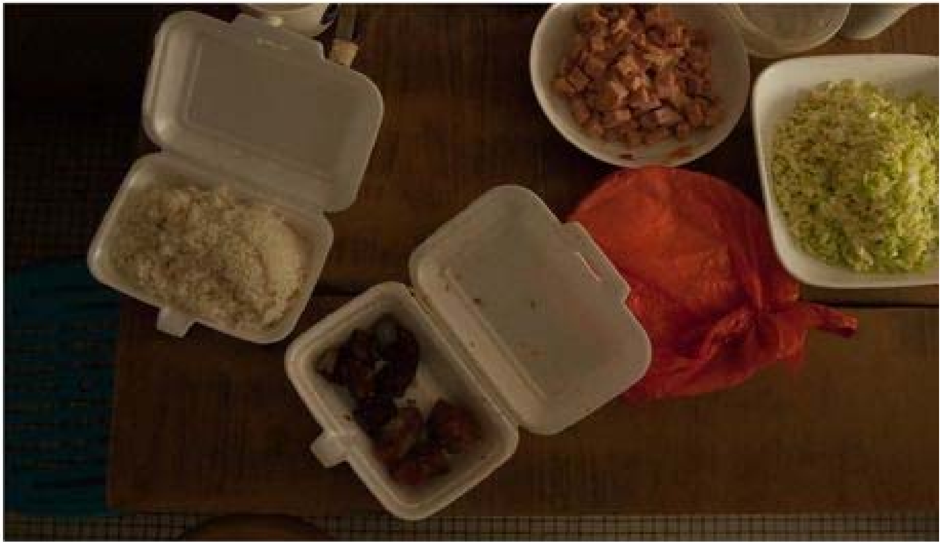
No. 7 : Division