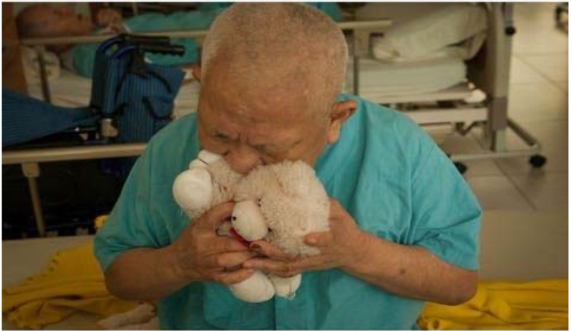
No. 6 : Alone with my daughter

at Exactly Foundation Residency, August 2016