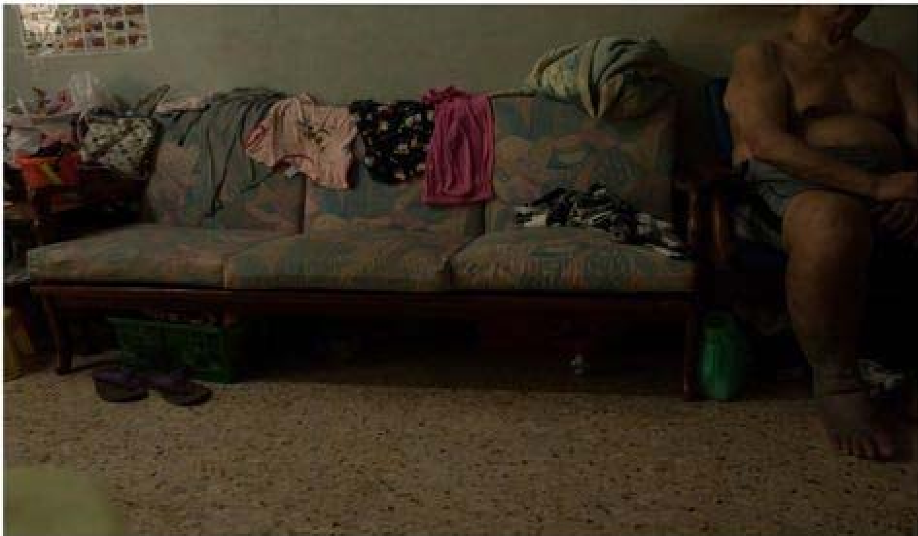
No. 2 : Reality