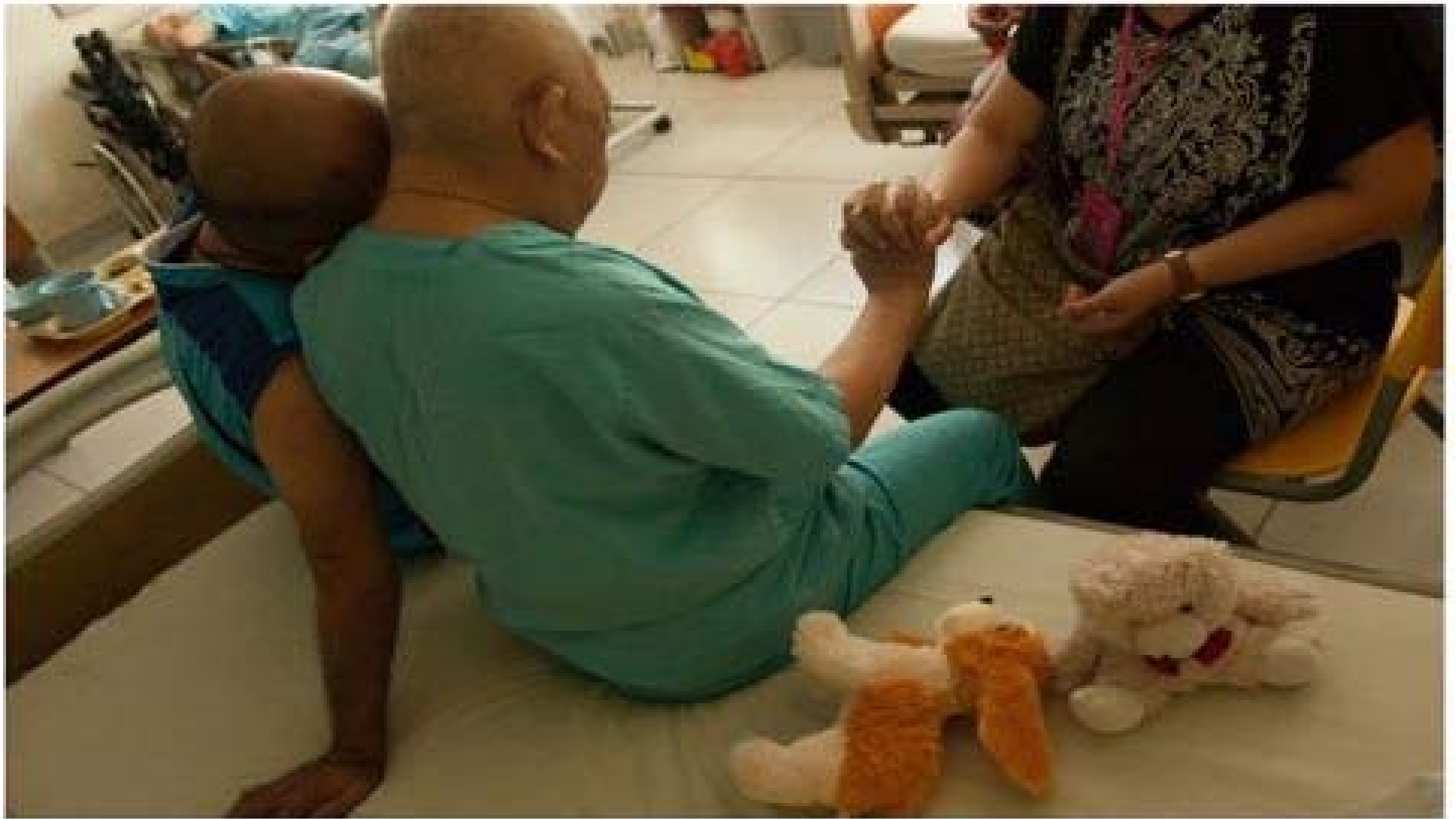
No. 5 : Children