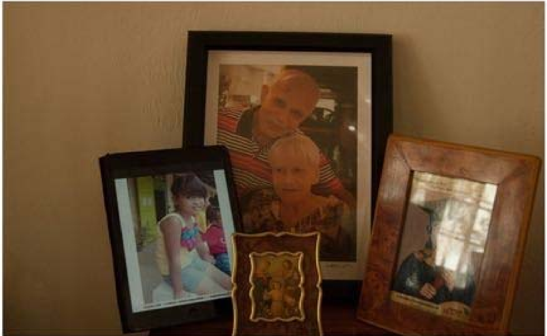
No. 11 : Family portrait