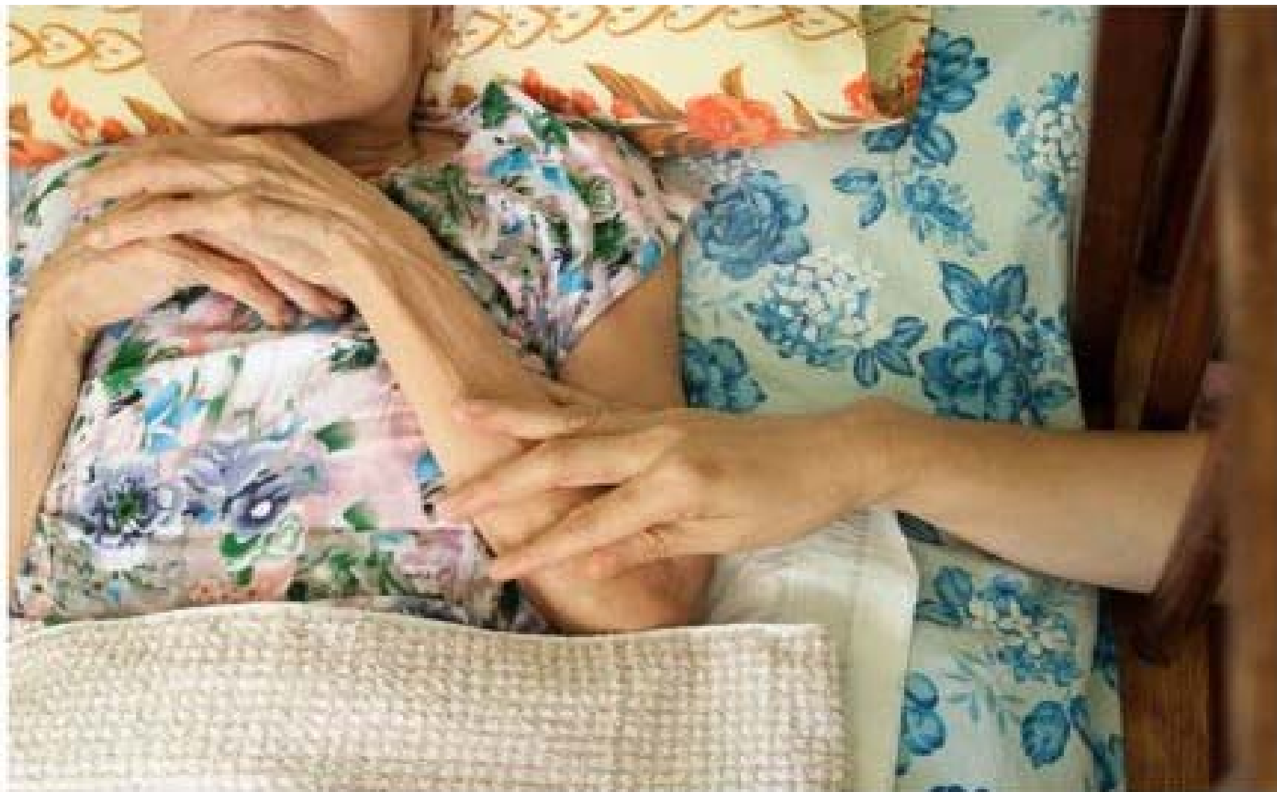
No. 12 : More than a maid