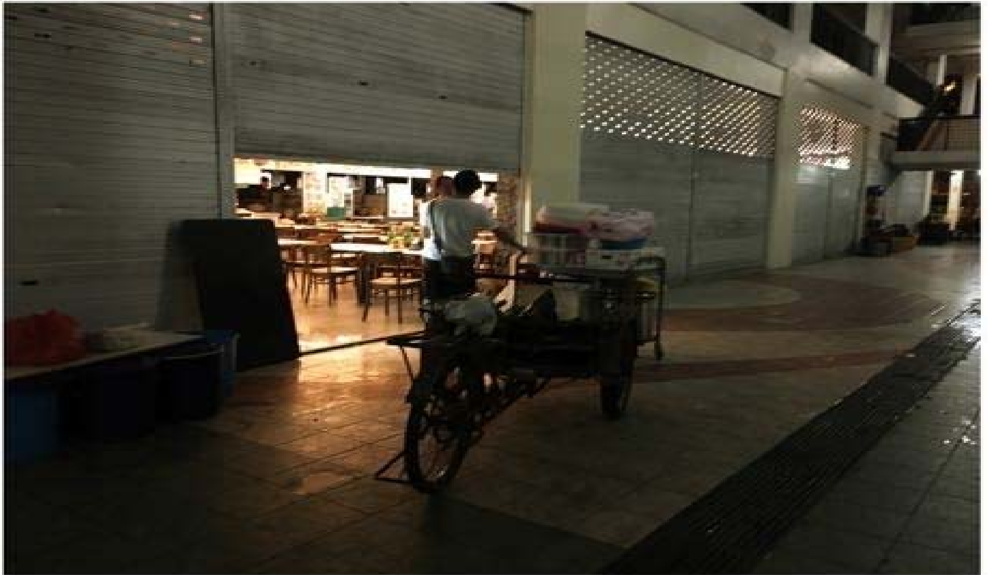
No. 14 : All I care about