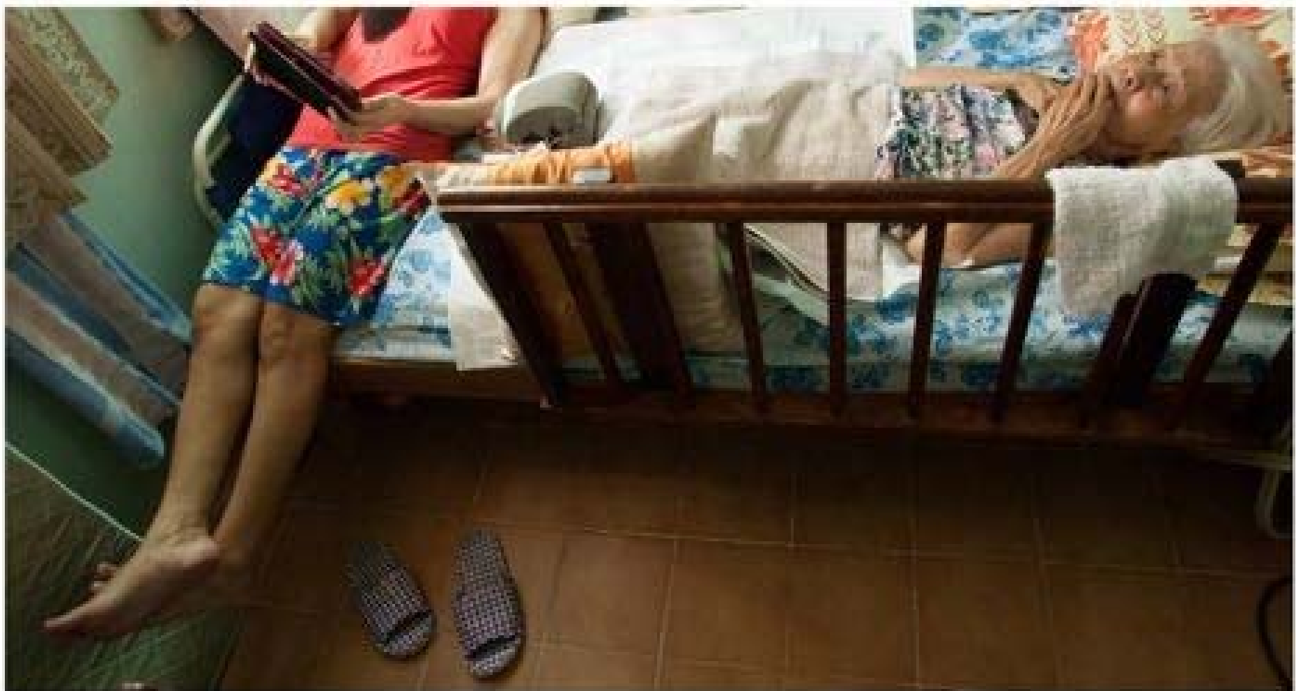
No. 10 : My daughter