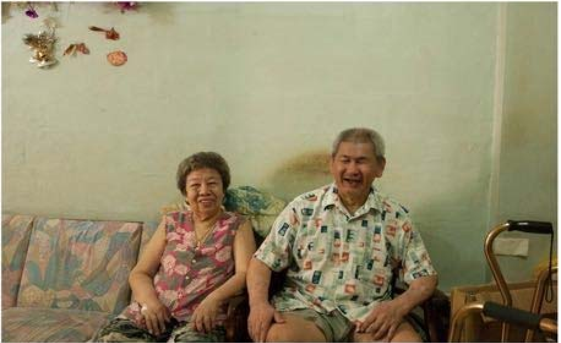
No. 1 : Bright lights