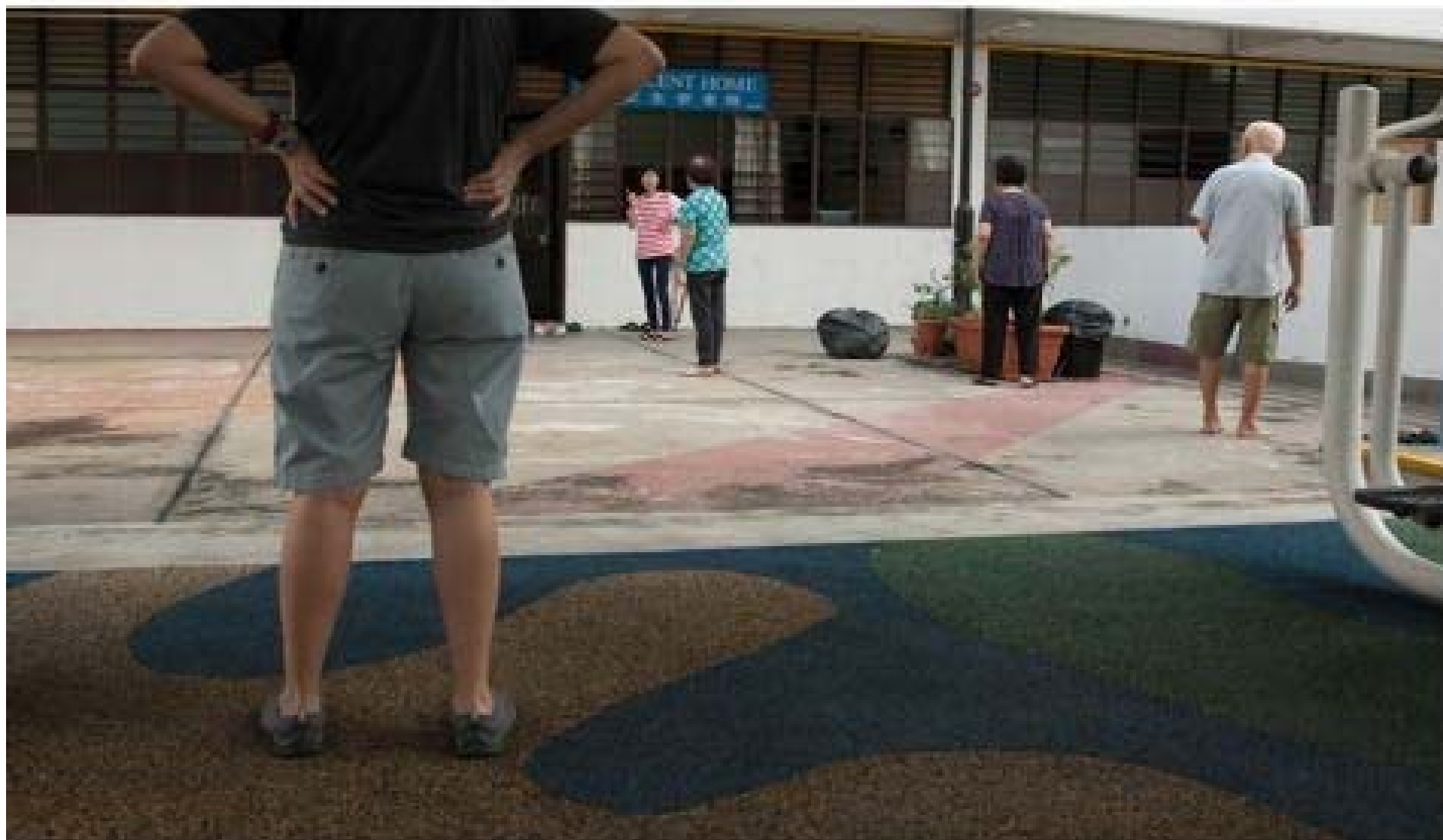
No. 13 : Regiment