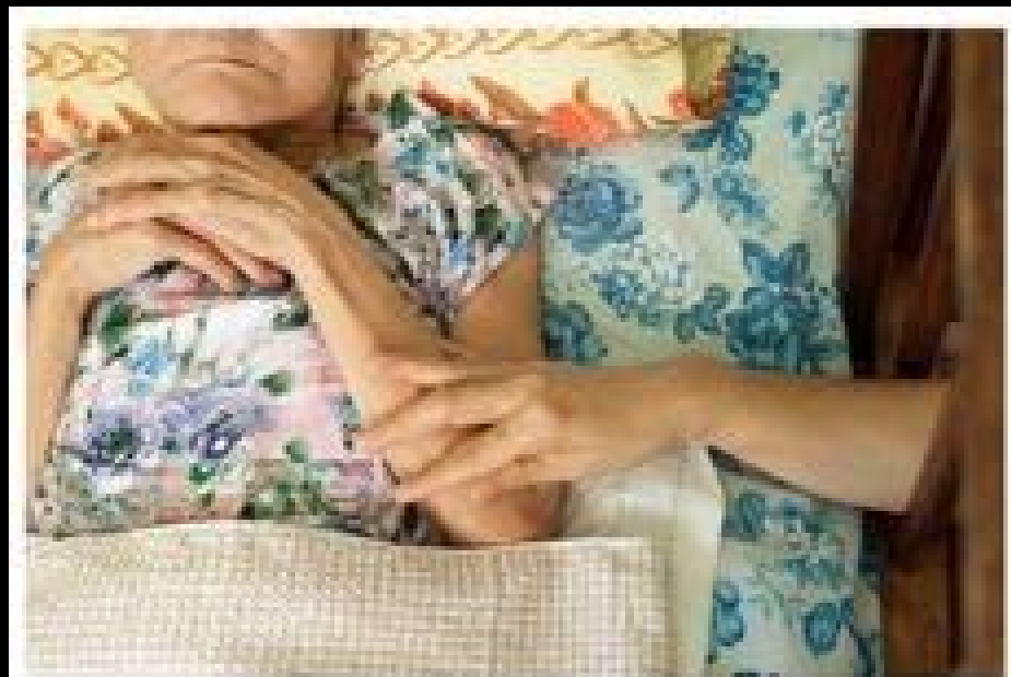
No. 12 : More than a maid

WHO ARE THE REAL CAREGIVERS, WHAT BINDS THEM WITH THEIR SENIORS, AND DO OUR POLICIES PLAY ANY ROLE IN THIS RELATIONSHIP?