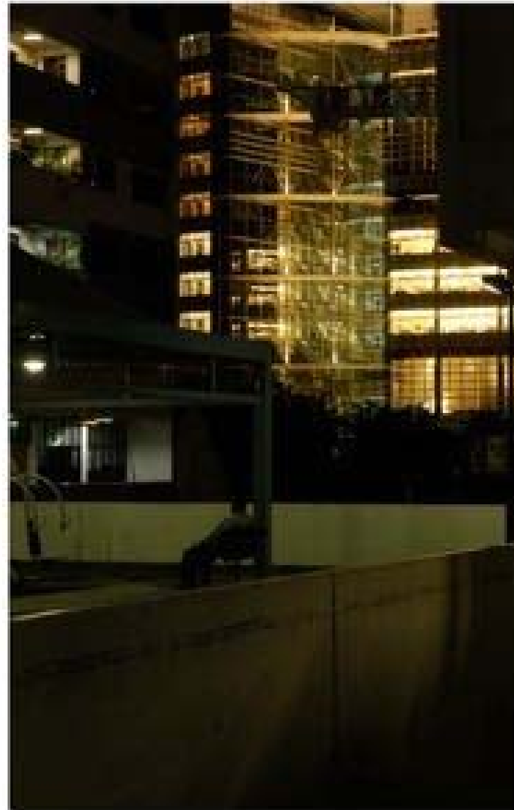
No. 16 : Neighbourhood strangers