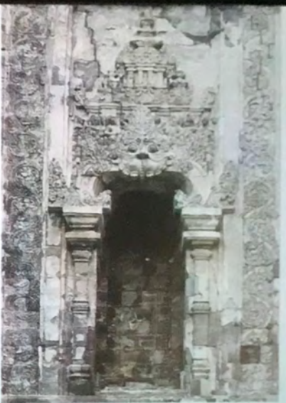
KALASAN, Central Java, 8 th – 9 th century kāla-makara frames at different scales, and decorative motifs