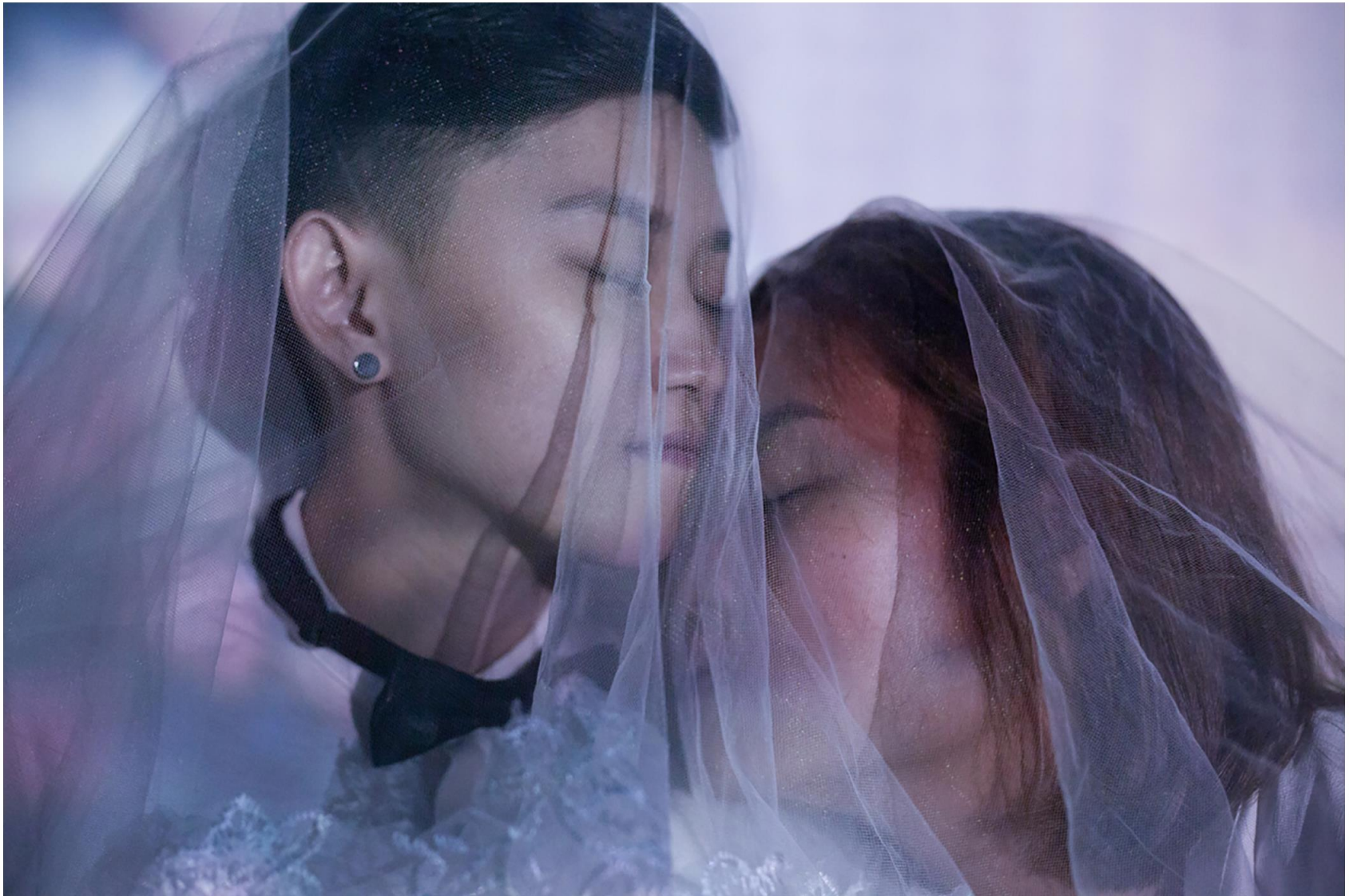
How She Loves | Exactly Foundation | 2018