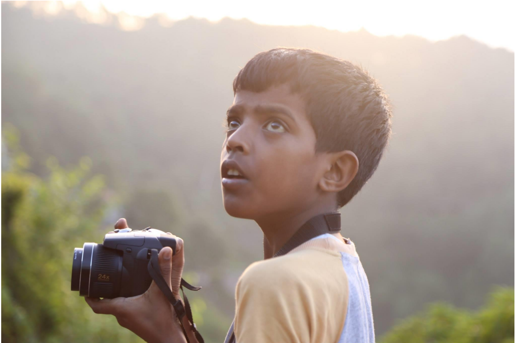
Clicking Together | 2013-Present