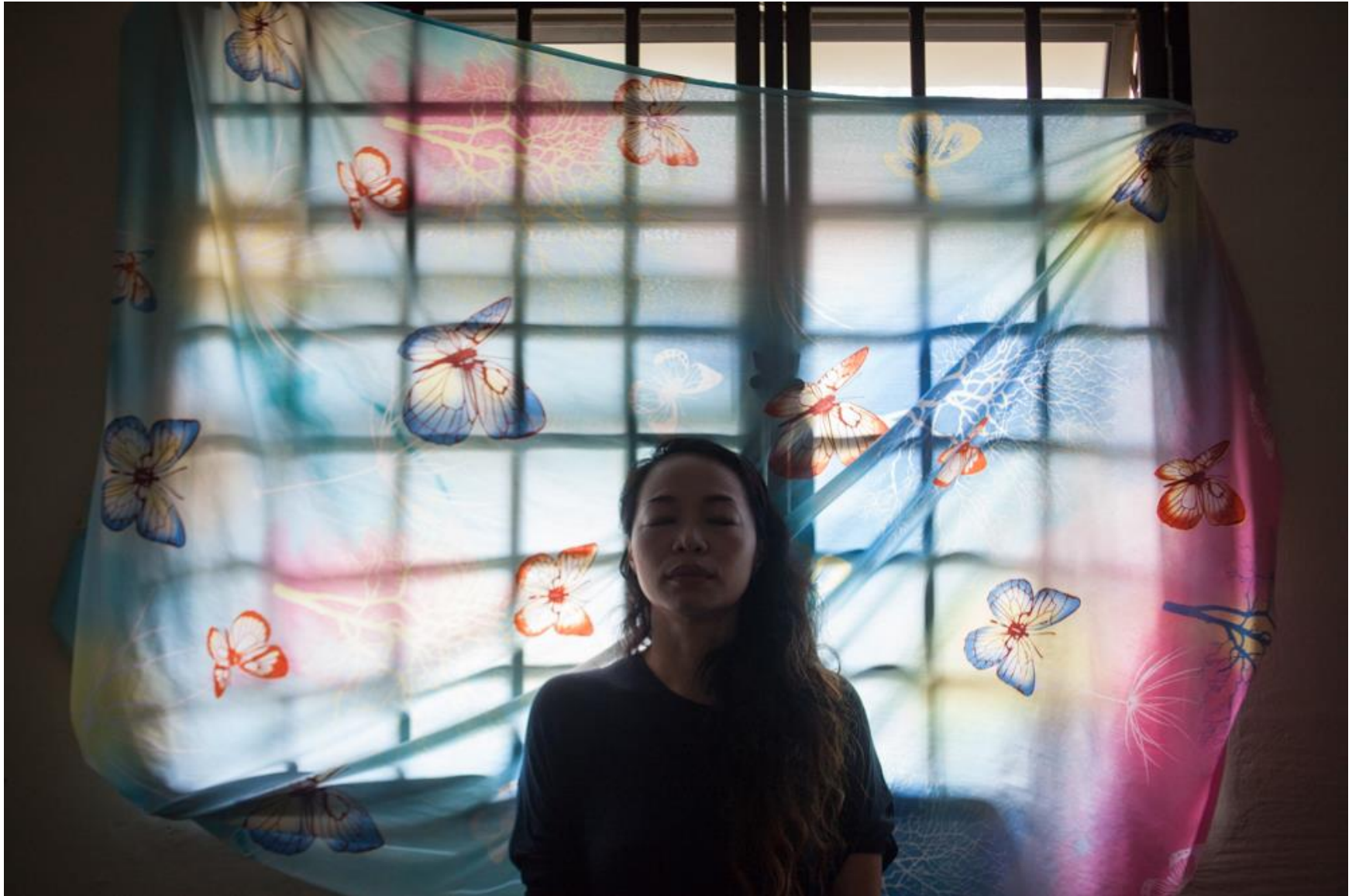
To Make Our House Like A Castle | Global Gender Parity Initiative | 2018