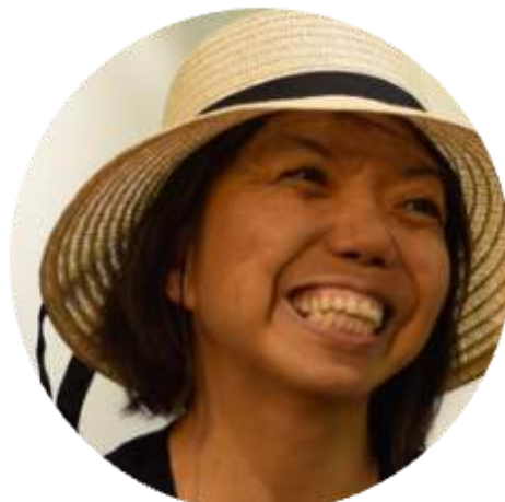
Anthea Ong Fmr NMP Multiple Issues