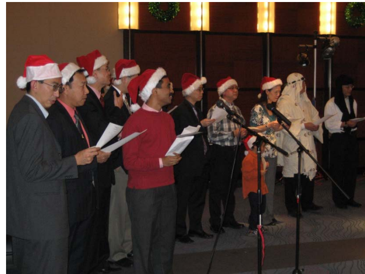
Singapore Perspectives 2010