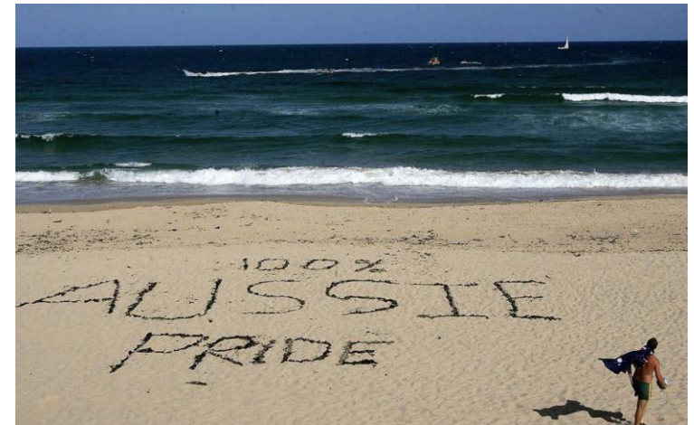
The Cronulla Riots (NSW, 2005)