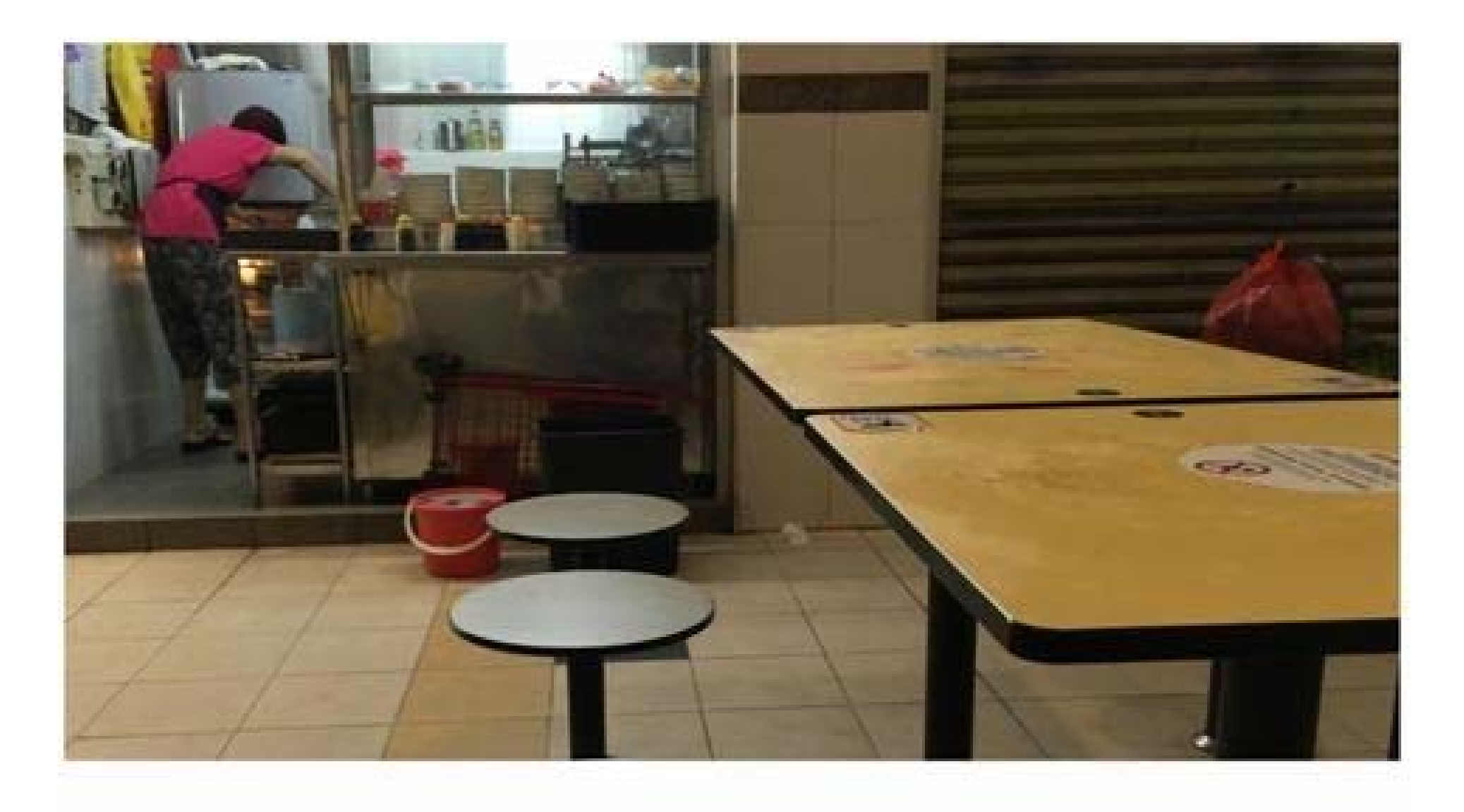
No. 15: 5am everyday