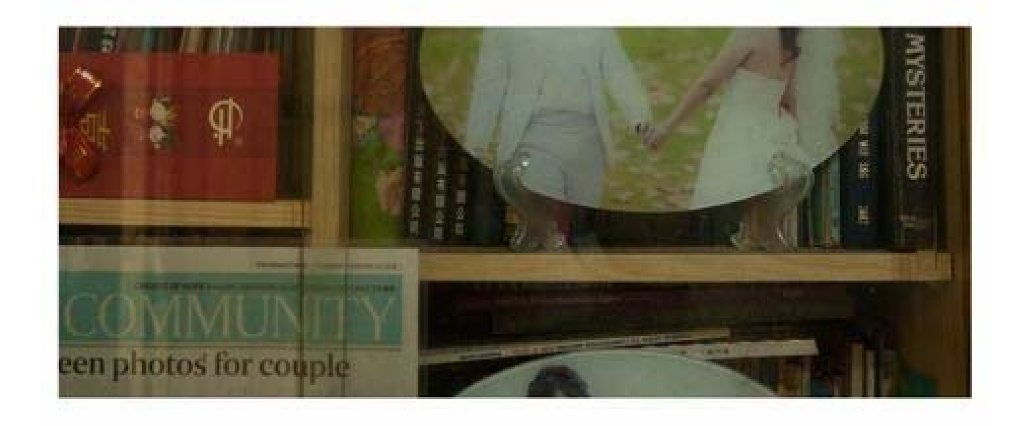
No. 9 : Mysteries