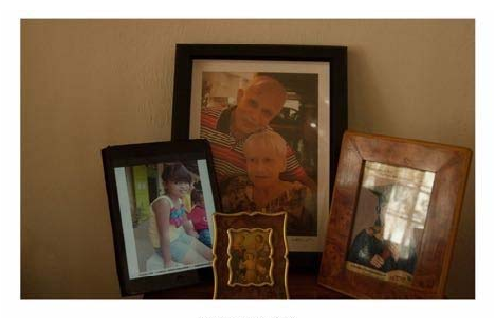
No. 11: Family portrait