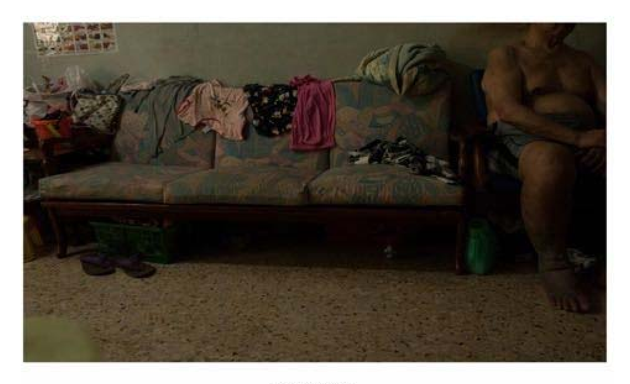
No. 2: Reality