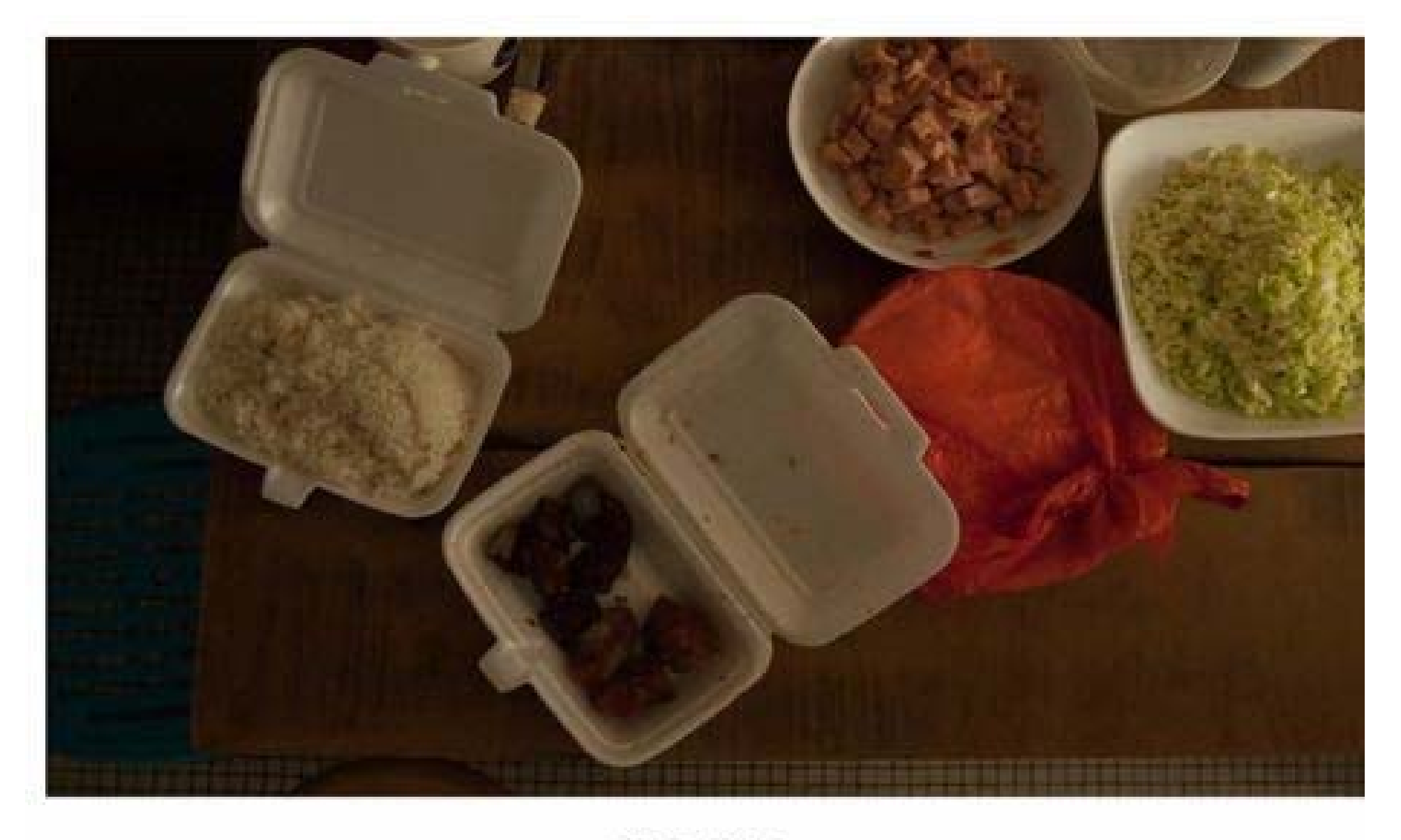
No. 7: Division