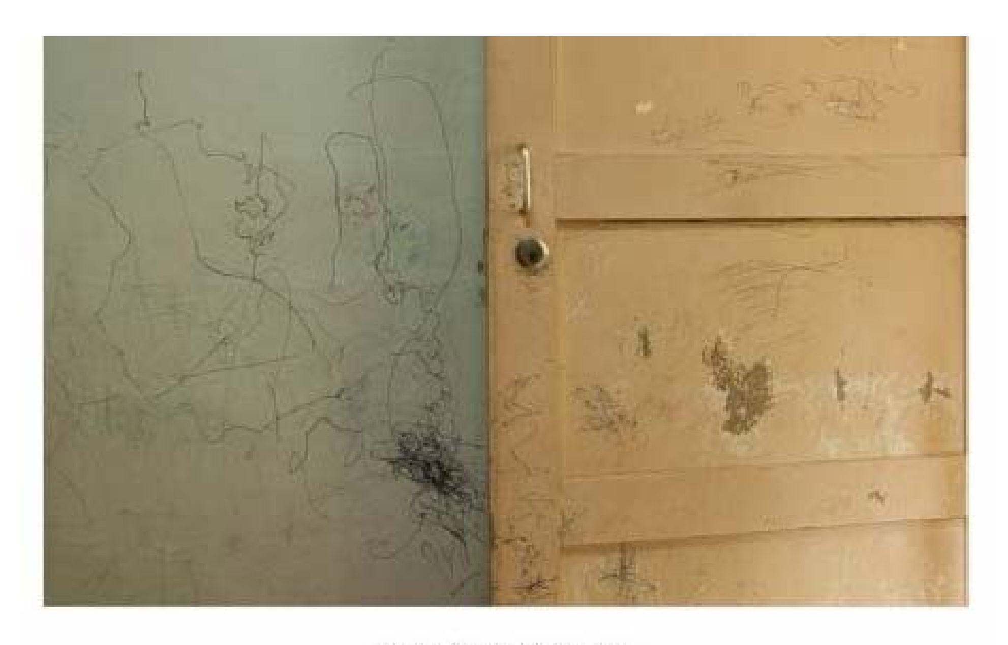
No. 8 : You don't belong here