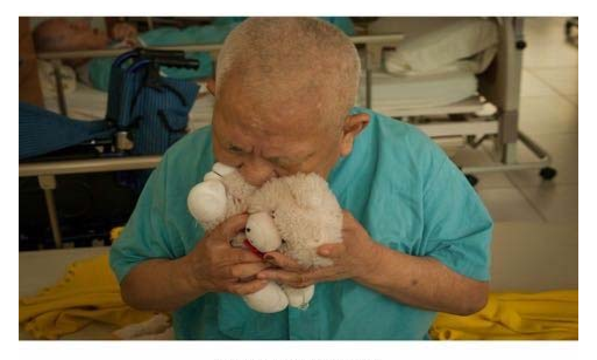
No. 6: Alone with my daughter