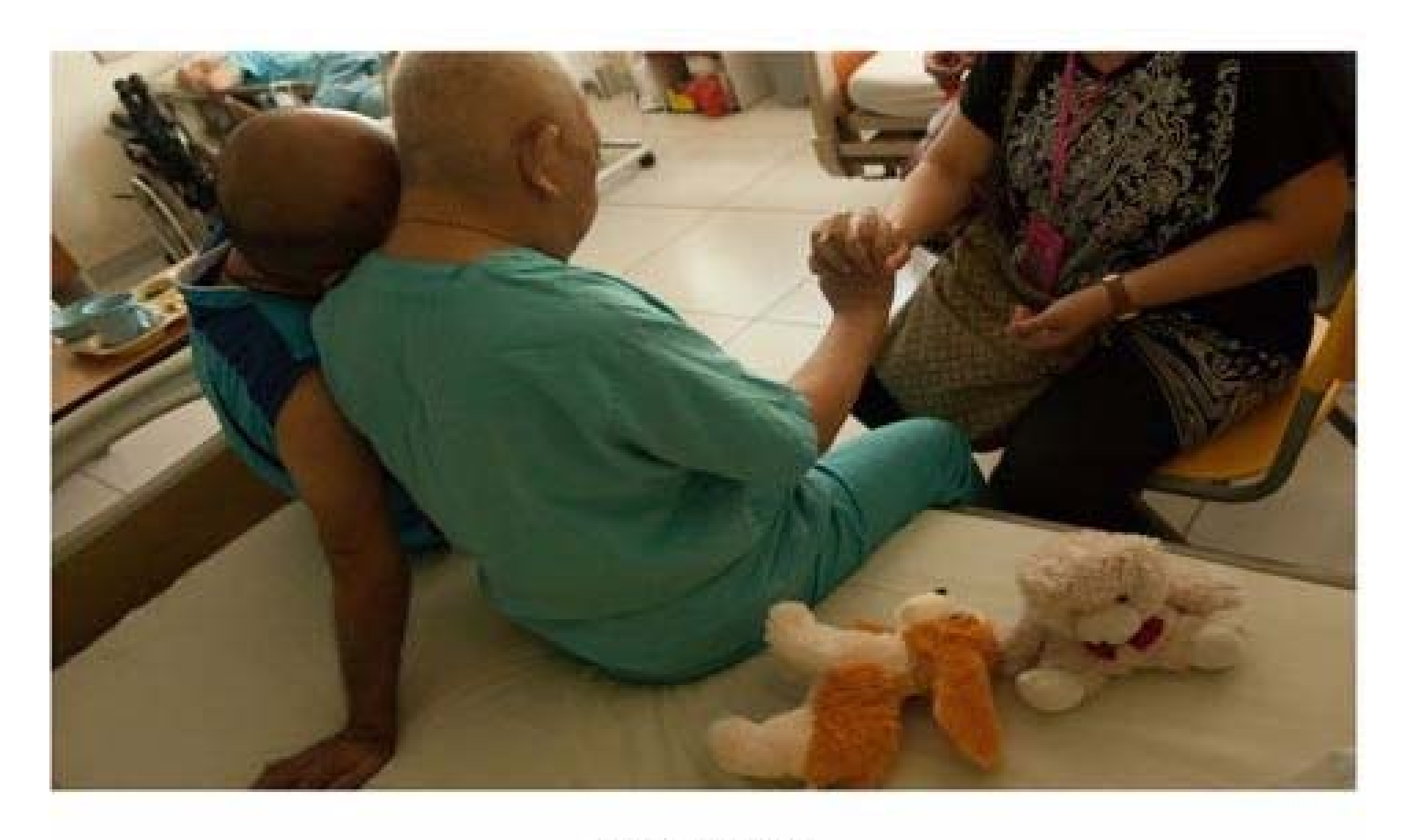
No. 5 : Children