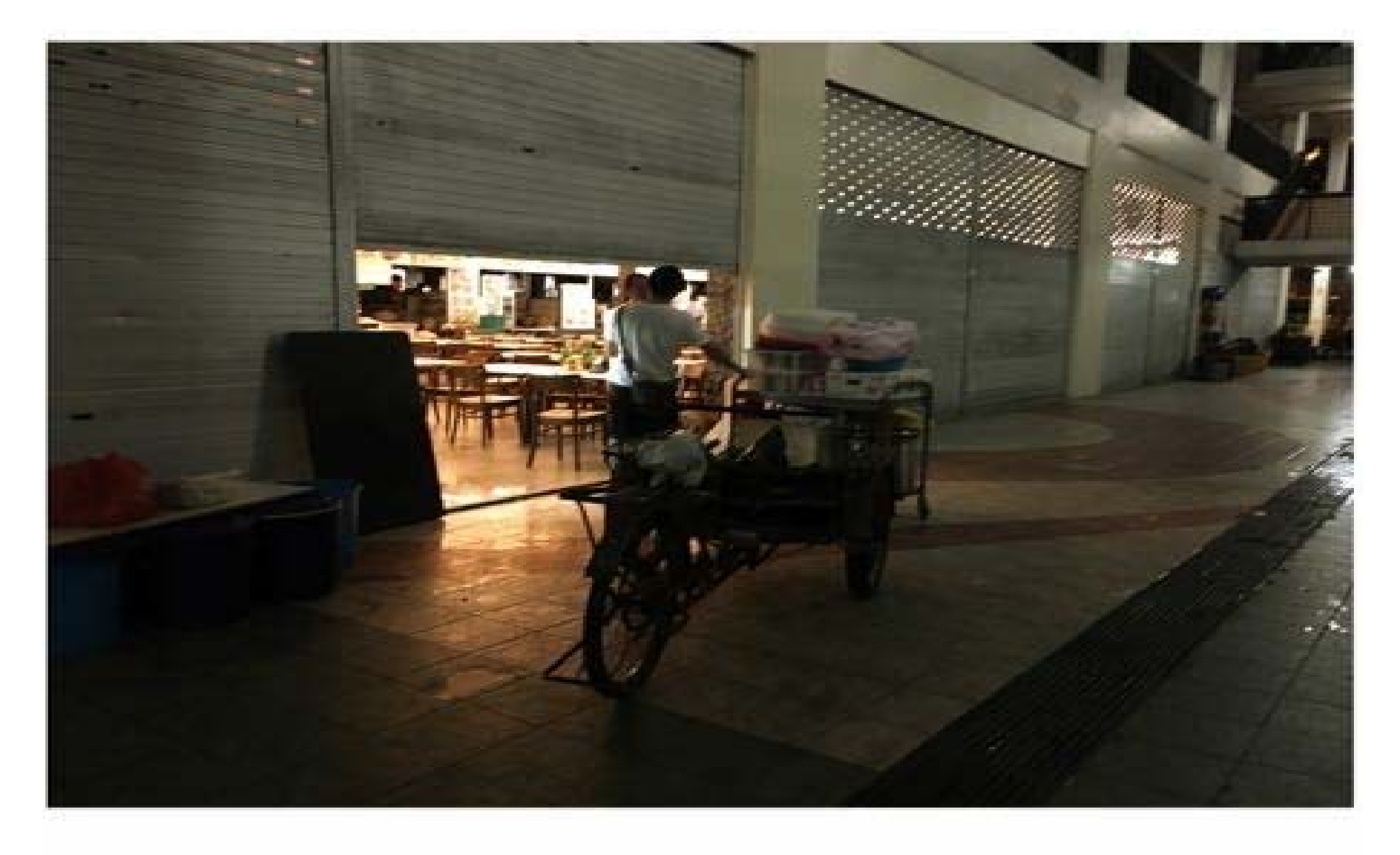
No. 14: All I care about