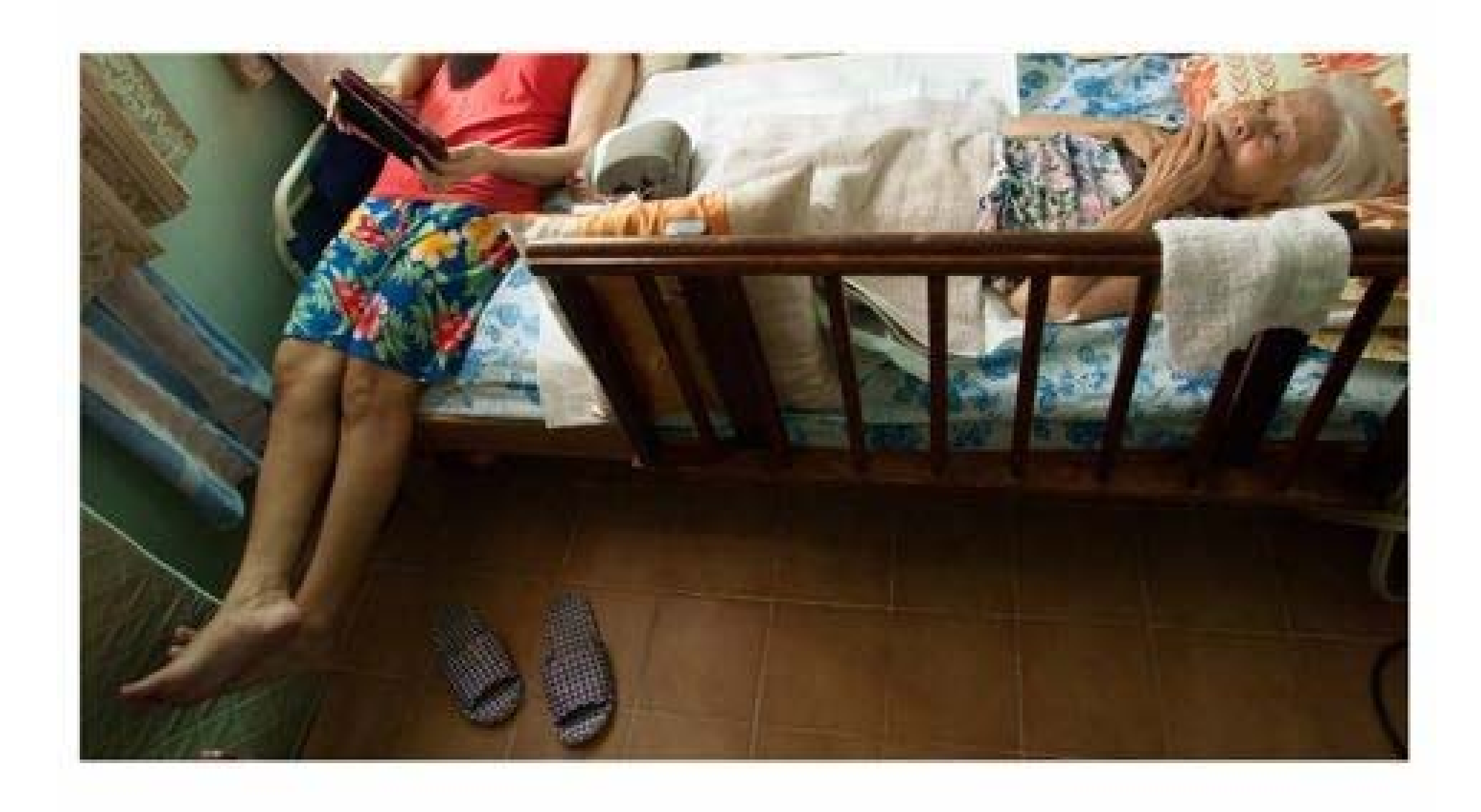
No. 10: My daughter