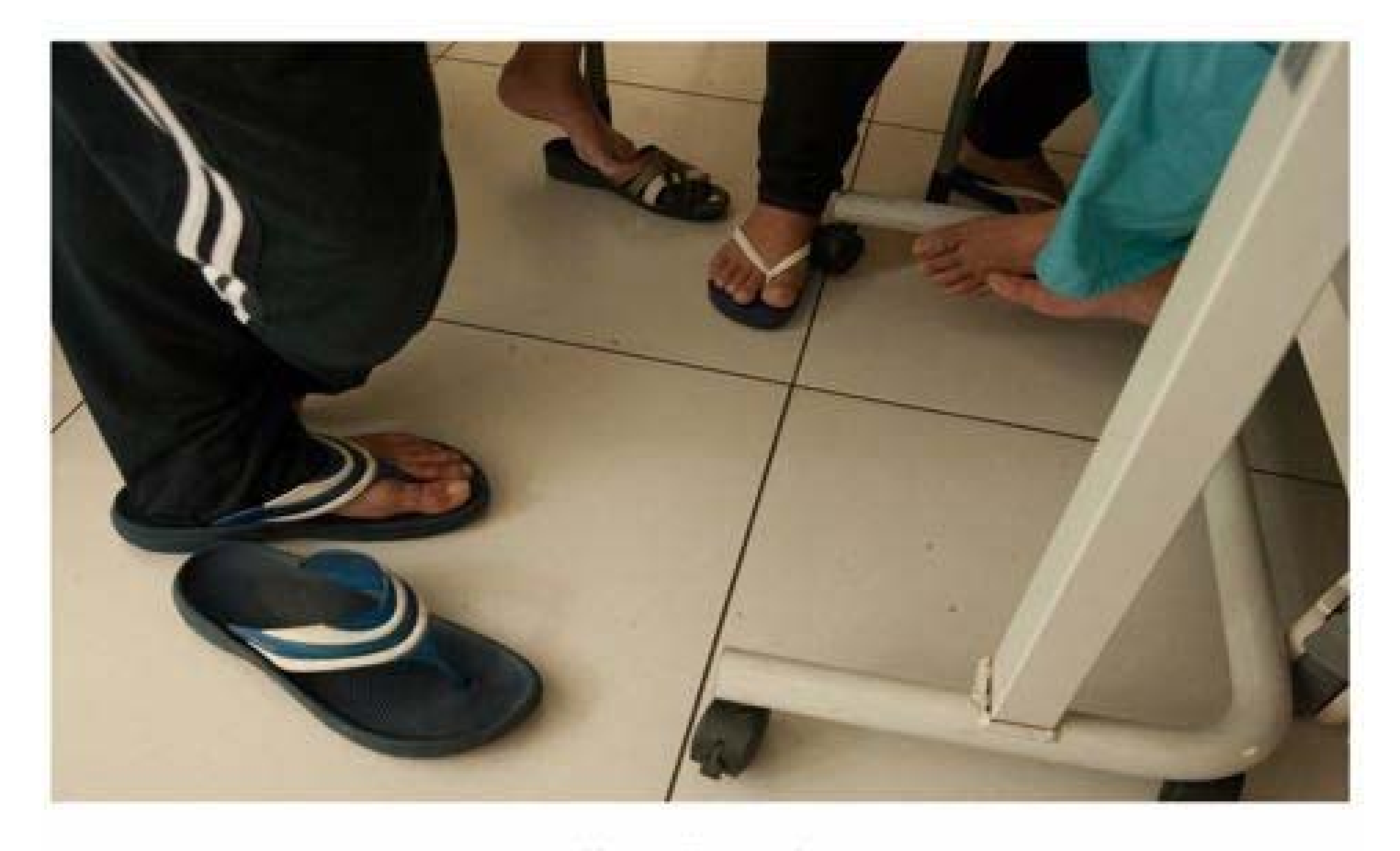
No. 4: Home again