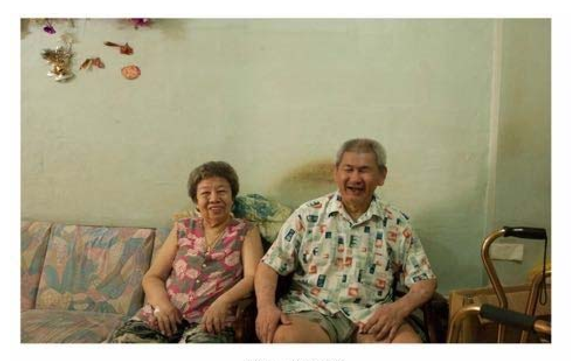
No. 1 : Bright lights