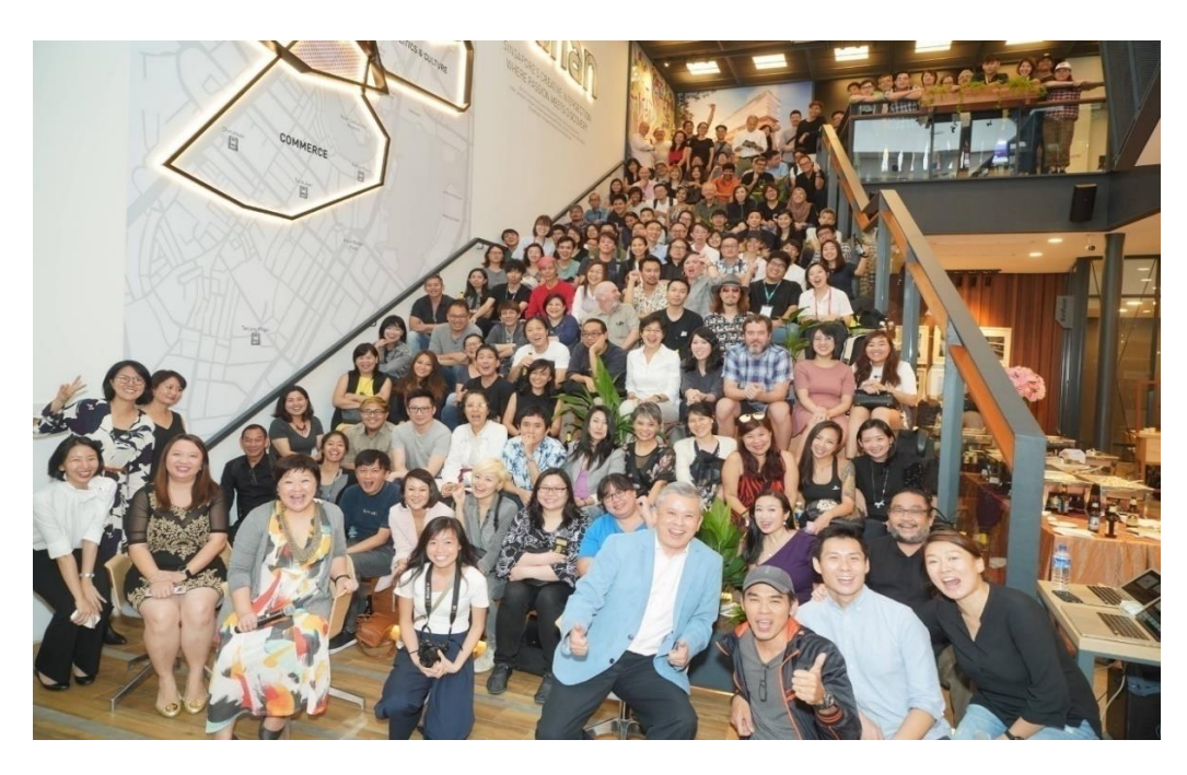
A "wefie" of the motion pictures community in Singapore taken in 2018.

Whether you are a freelancer, an employee or a company owner, we are in it together as film practitioners and media professionals. Remember what we said about this kind of long-term relationship? I mean, it is a marriage for life, right? We are in it for the long haul; it is a life-long profession. And we want to be able to contribute to the conversation, help others help us, and engage on industry policies and grant schemes, and be recognised by not just IMDA within one ministry, but across different ministries as well.