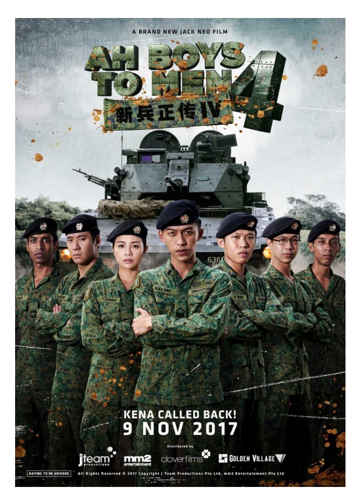
Poster of hit movie Ah Boys To Men 4, produced by mm2.

People always come to us and say, "Yah, our movie is a Singapore movie but it will travel, it will go everywhere, everyone will appreciate it." Occasionally, maybe once in a blue moon, it happens but I doubt it. Only Hollywood movies travel, internationally. Other movies travel in the arthouse circuit but that is not travelling. That is going to markets, and they would have a small opening in different markets. But big commercial travelling for a local movie, it does not just happen. Sporadically, maybe you have a French movie that has done well. Even Korean movies, they mostly do not work for us. We know this because we run a cinema as well. Of course, China movies only work in China. In the past, Hong Kong movies used to travel for the Chinese population but no longer so. And Taiwanese movies, occasionally you have an You are the Apple of My Eye or Our Times. But other than that, most movies do not travel.