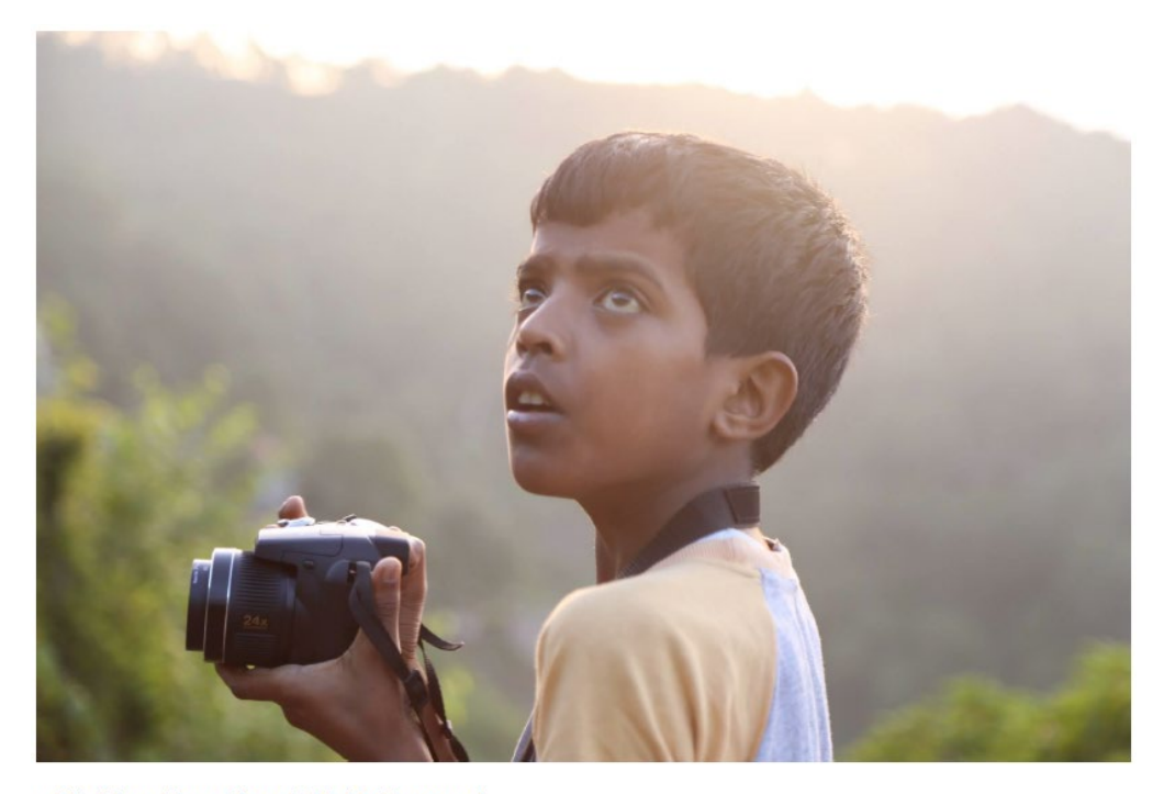
Clicking Together | 2013-Present

bring up the examples of Magnum Foundation, which funds socially-themed work, and hosts creative labs looking at countering majority narratives; Open Society Foundations, which also funds and exhibits work in public places; and the International Center of Photography, which continually contextualises its programming. It is really a fundamental question of the environment and the discourse created. One cannot have critical discourse without provocation or questioning. They come hand in hand. How would one then encourage it and not suppress it?