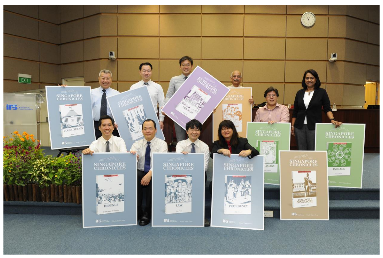
Authors of the first 10 Singapore Chronicles series titles launched on 10 December

"There is a certain Singapore Spirit that courses through our history, and through the volumes of the Singapore Chronicles. The Singapore Spirit is made up of the qualities shown by our pioneers as they made a big difference, out of almost nothing, by being resilient, rugged, resourceful. It has grown out of our place in the world — principled, adaptable, self-reliant and open to the world. And it is what we have developed amongst ourselves as friends and neighbours — paying attention to and caring for one another; drawing strength from our rich racial, religious and cultural diversity."