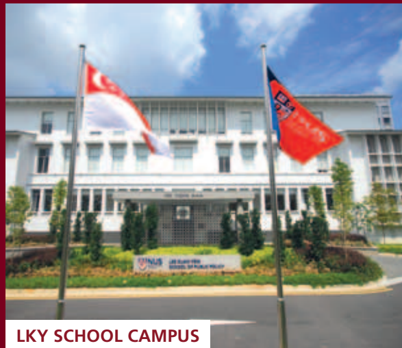
LKY SCHOOL CAMPUS

Educate and Inspire current and future generations of leaders to raise the standards of governance in Asia, Improve the lives of its people and contribute to the Transformation of the region