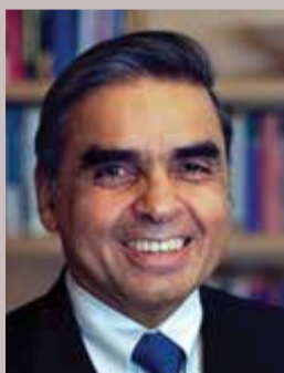
Prof Kishore Mahbubani

Dean, Lee Kuan Yew School of Public Policy