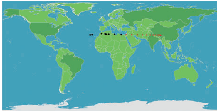
Figure 2. The world's economic centre of gravity, 1980–2007 (black) and extrapolated (in red, reduced size, italicised in table), at three-year intervals.