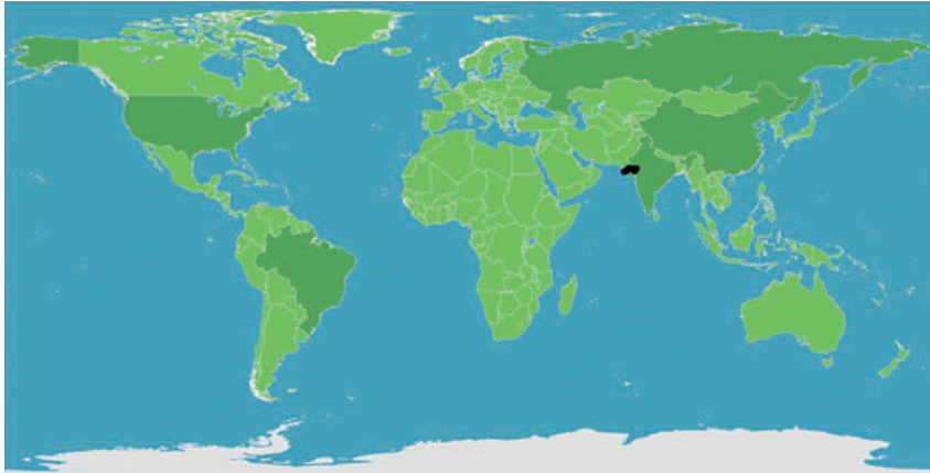
Figure 3. Flat world's economic centre of gravity, 1980–2007.