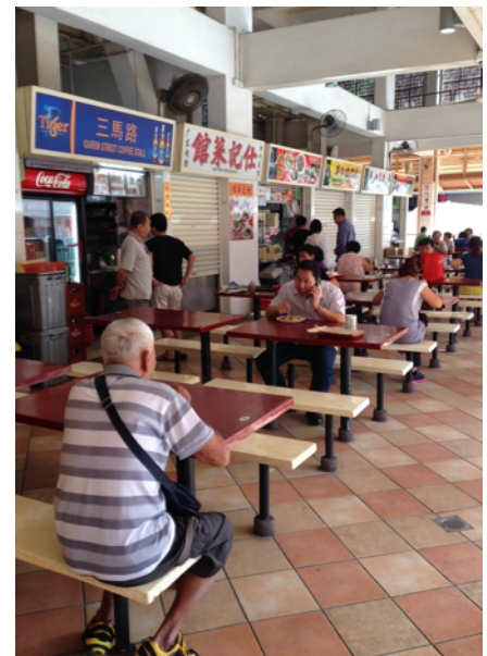
Exhibit 1: Albert Centre Market & Food Centre, 2015.

In modern day Singapore, hawker centres formed an integral part of the country’s food culture. In 2014, there were over 100 hawker centres in Singapore. Each hawker centre housed between 20 to over 200 stalls, 4 with each stall specialising in a different type of cooked food. Customers would queue for their orders, seat themselves at the common seating area, and fill their stomachs with cheap, tasty food. (Exhibit 1)