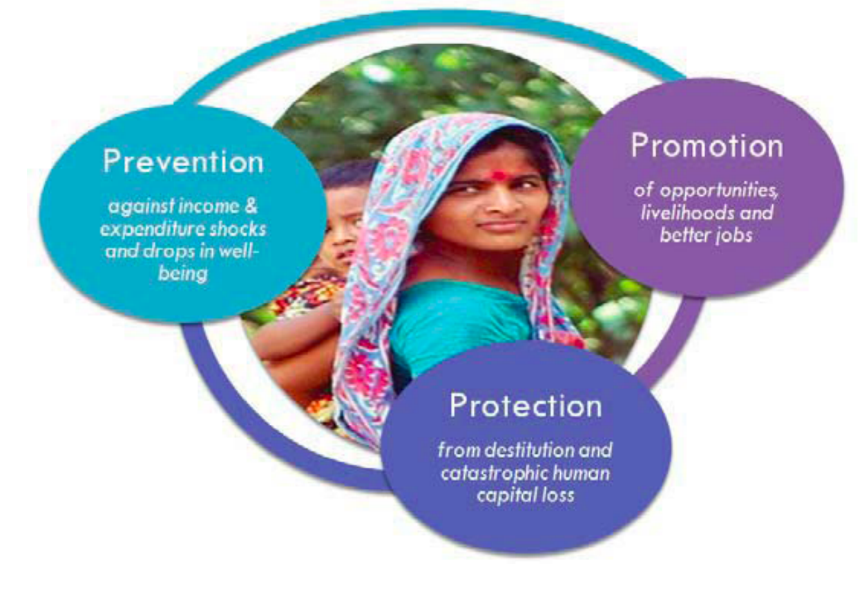
Fig. 1: The '3P' Framework: Functions of Institutions for Resilience and Opportunity

both social protection and labor policies .. promote opportunity, productivity and growth , notably through building human capital, assets and access to jobs, and by freeing families to make productive investments because of their greater sense of security. ... People across the world are striving to improve their livelihoods while addressing risks – which range from systemic shocks such as economic crises or natural disasters, to more idiosyncratic shocks such as unemployment, disability and illness. For them, it is essential to have institutions that enhance both their resilience and their opportunities – key among which social social protection and labor institutions (sic) (World Bank, 2011: 1; emphasis original).